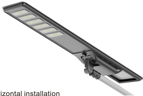
① Horizontal installation