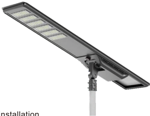
② Vertical installation